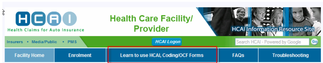
Figure 2.5: Self-training Materials

Many self-help tools reside on the HCAI Information website, www.hcaiinfo.ca .